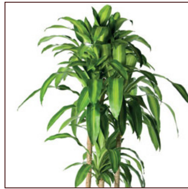
Dracaena fragrans 'Massangeana' (Tall)