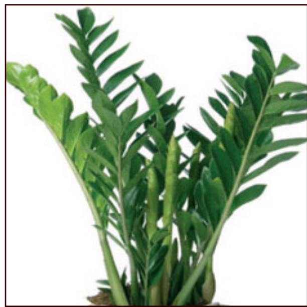
Zanzibar Gem Medium