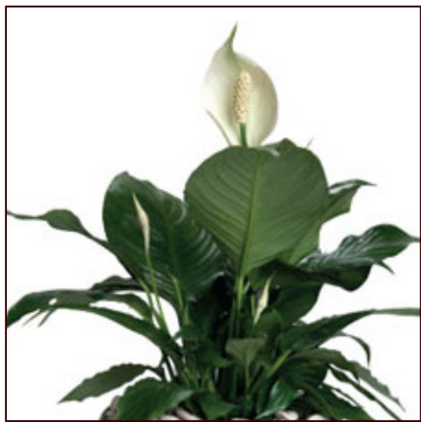
Peace Lily Small