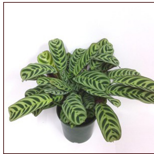
Calathea sp. Small - Medium