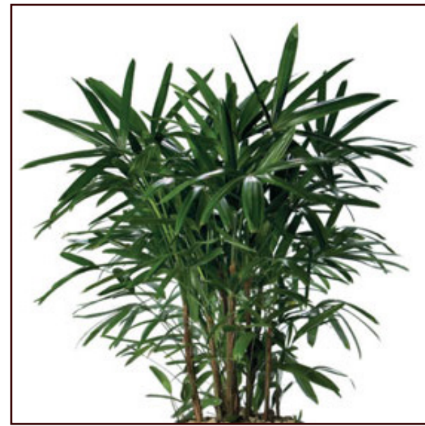
Rhaps excelsa (Tall)