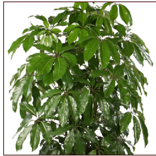
Schefflera amate (Tall)