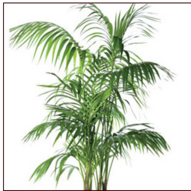
Kentia palm Medium -Tall