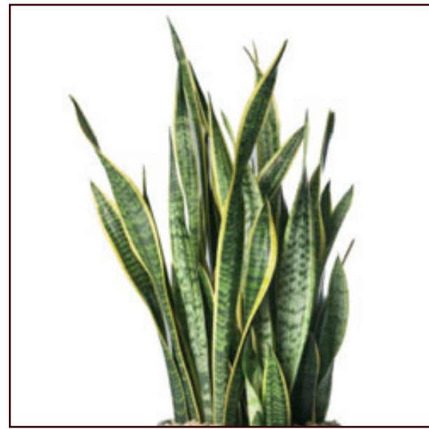
Sansevieria (Medium - Tall)