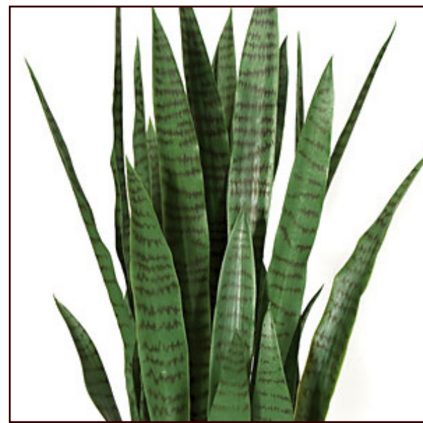
Sansevieria (Medium - Tall)