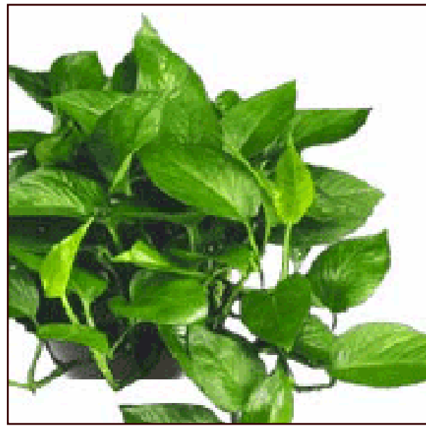
Devil's Ivy (Tall)