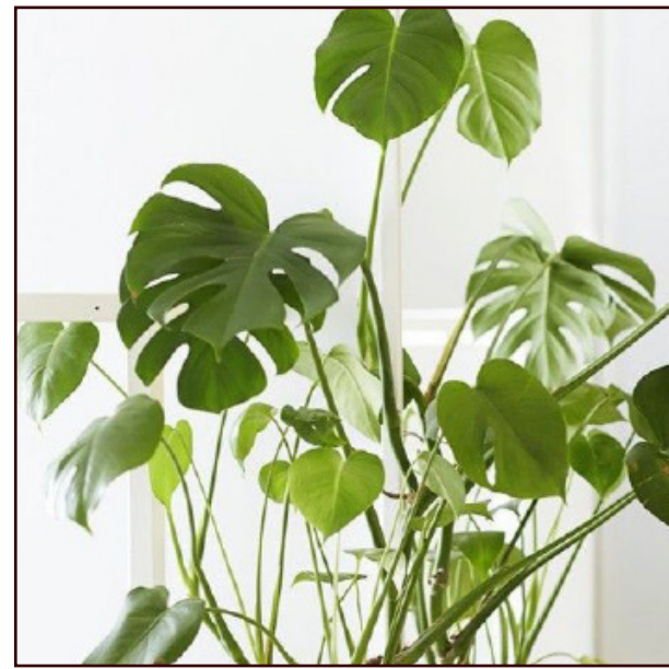
Monstera deliciosa (Tall)