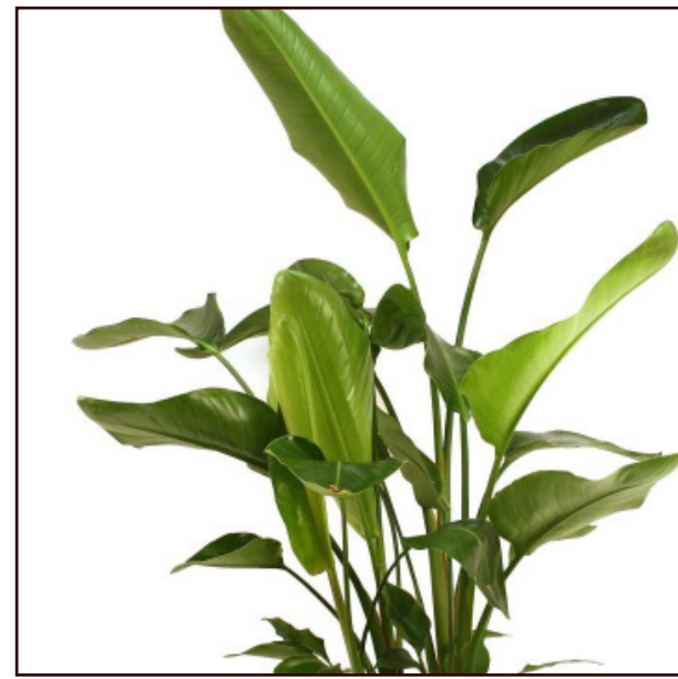
Strelitzia nicholaii (Tall)