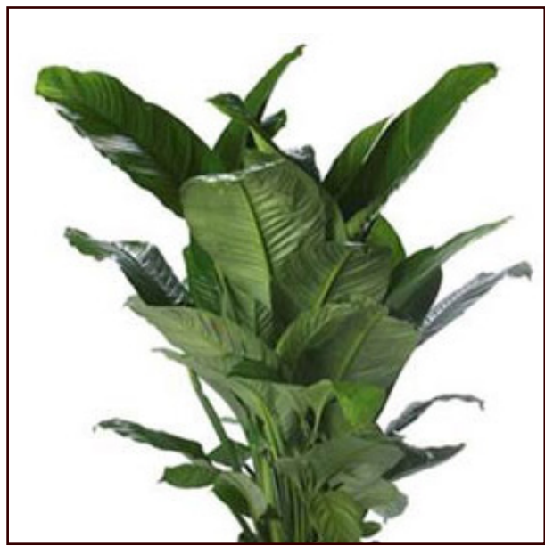
Peace Lily - Sensation (1-1.2m tall)