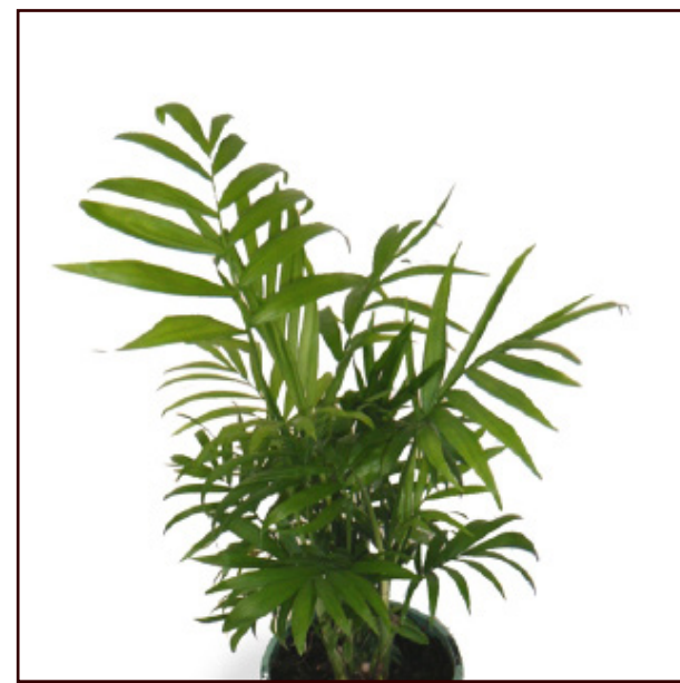
Parlour Palm Small