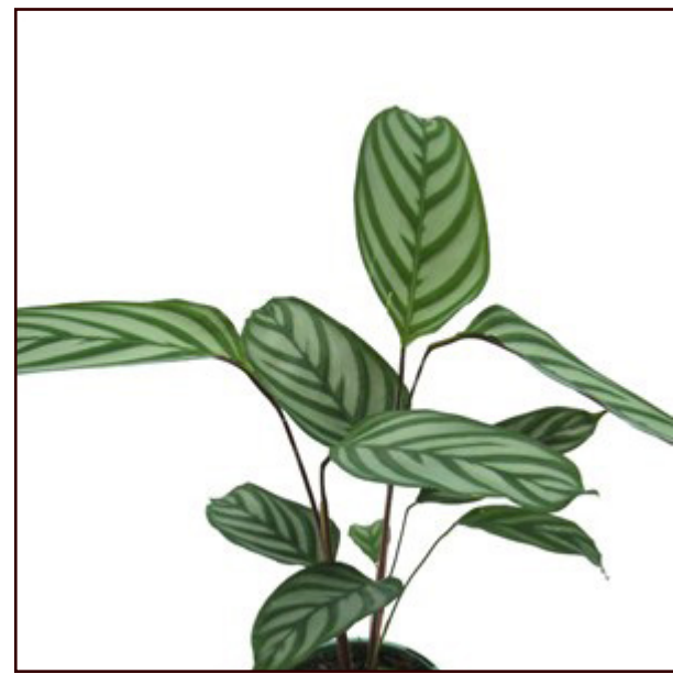
Calathea sp. (Medium)